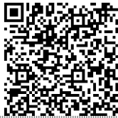
Raina the divinatrice