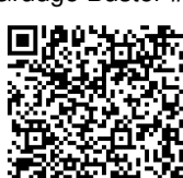
Grudge Buster #2