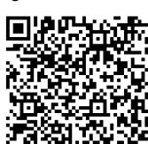
Vengeance Seeker #2