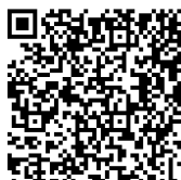
Giant Rats #1