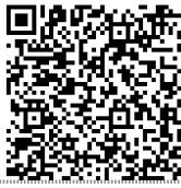
Knights of the Grail #1